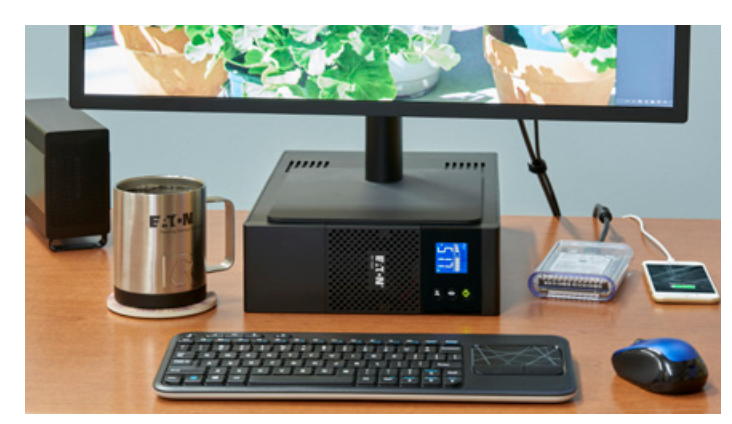
Convenient form factor: use as a desktop monitor stand to fit in confined spaces.

The 5S provides up to 4 minutes of high efficiency and energy-saving battery backup and surge protection for your home networking equipment. For a detailed, interactive battery runtime chart, please visit: Eaton.com/5S — then view the models tab for details on each model.